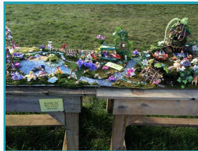
2017 1st Place Winner - Adult

Thank you! Marketing Department Mid-America Festivals 952.496.9232 printern@renaissancefest.com